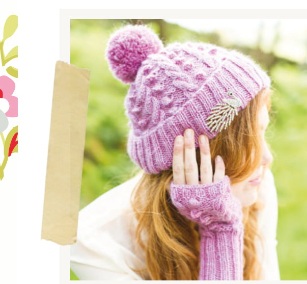
CABLED AND BOBBLE HAT AND HAND WARMERS